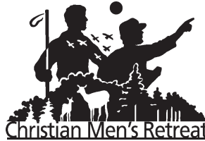
Christian Men's Retreat