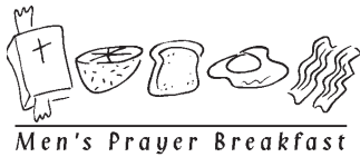
Men's Prayer Breakfast