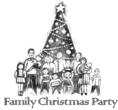
Family Christmas Party