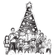
Family Christmas Party