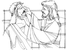
The Blind Man of Bethsaida