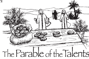
The Parable of the Talents