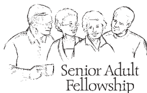
Senior Adult Fellowship

There will be NO MEETING on March 24. Members of the group are encouraged to meet in the Gathering Space and attend Holy Thursday Mass together.