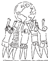
Youth Mission Project

To Rockford, IL Catholic Heart Work Camp. July 18-24. Open to incoming 10th graders thru 20 yr. olds. Visit www.heartworkcamp.com to see what it's all about. Registration forms available on the table by the church office. Sign up today.