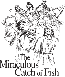
The Miraculous Catch of Fish