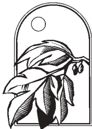
THE PARABLE OF THE FRUITLESS FIG TREE L.uke 13:6-9