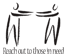
Reach out to those in need

Next Sunday at all the Masses, boxes will be placed near the columns in the church's Gathering Space to allow our parishioners to contribute to this project. These contributions will make it possible for our parish St. Vincent de Paul Society to help those in need in our parish and community.