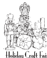
Holiday Craft Fair