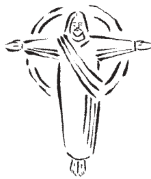
Transfiguration of the Lord